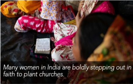
Many women in India are boldly stepping out in faith to plant churches.

In rural India, house churches are bustling with believers who travel for hours to worship and pray together. Many of these are led by courageous women, sharing their faith despite potential dangers. Here are the inspiring stories of two such women.