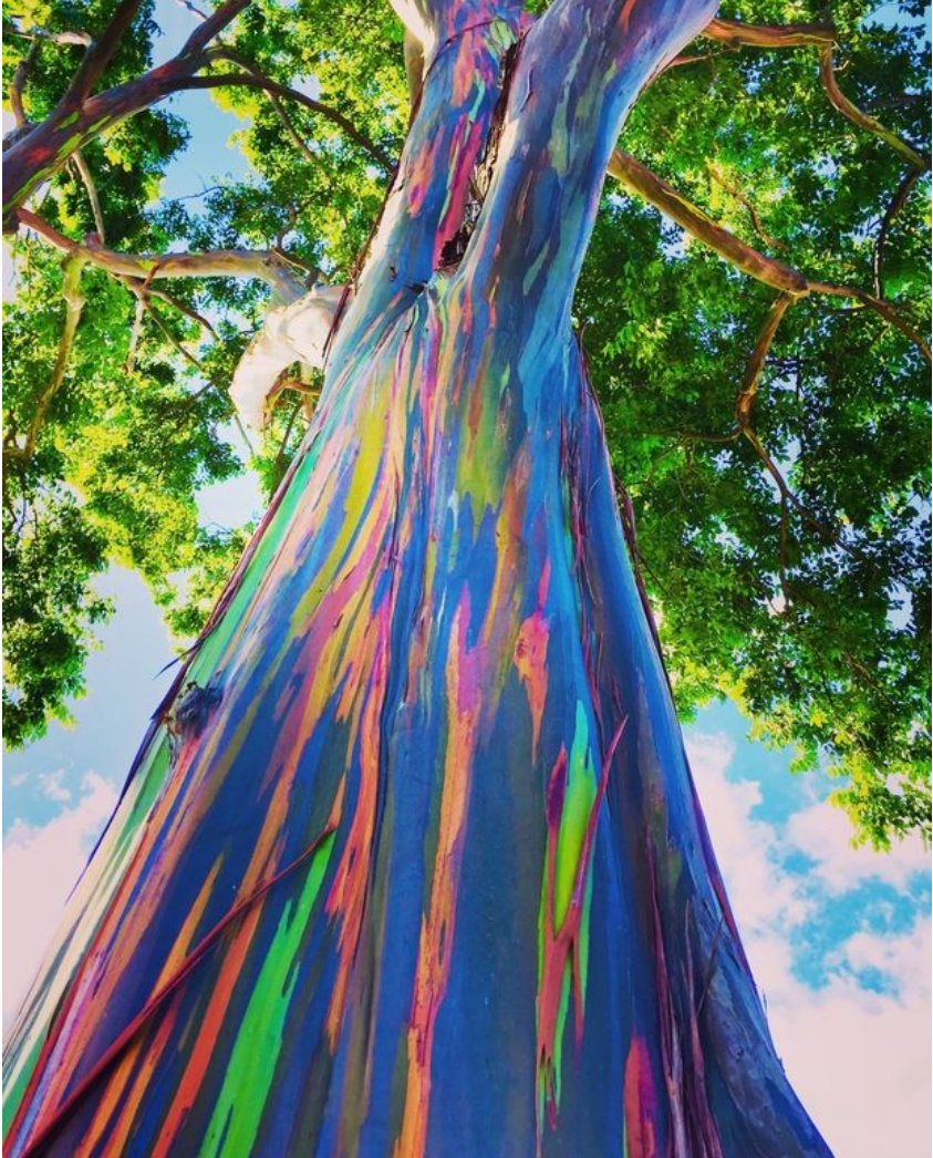
Rainbow Eucalyptus Tree, Hawaii