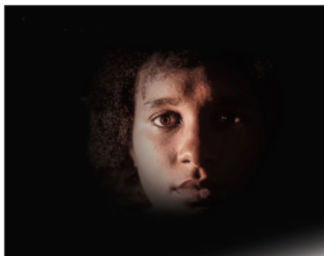
Children in D R Congo who are blind now have a chance to go to school.

A light in the darkness for children who are blind: a school built on BMS World Mission's foundations in D R Congo.