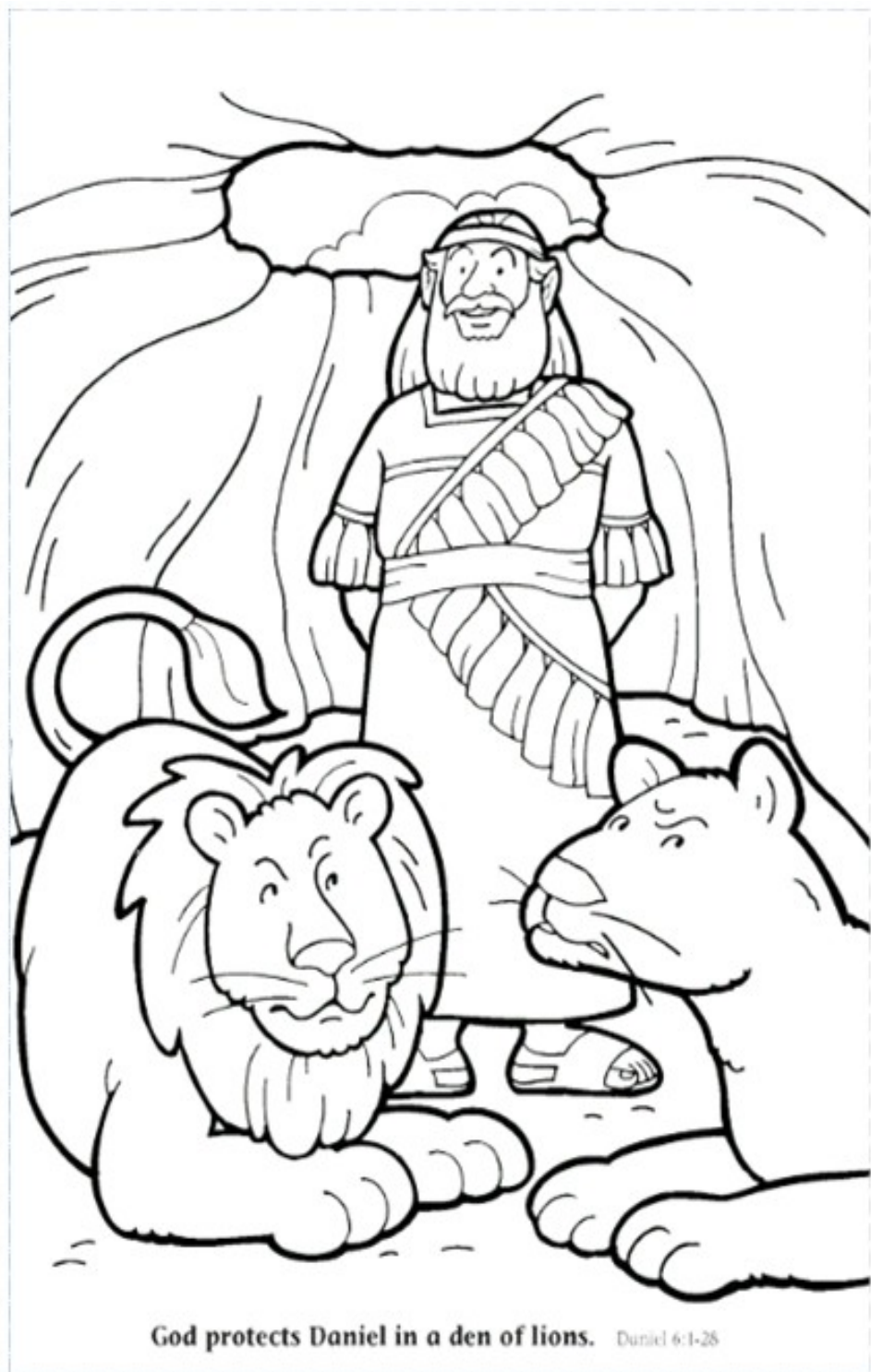
God protects Daniel in a den of lions. Daniel 6:1-28