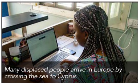
Many displaced people arrive in Europe by crossing the sea to Cyprus.